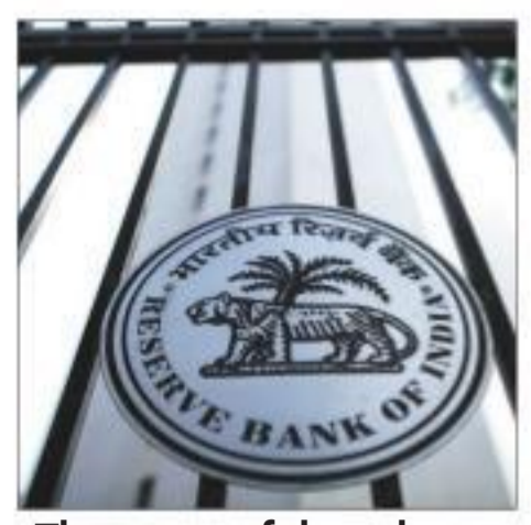
The terms of the scheme have also been tweaked

No interest subvention would be admissible for any period during which an account remains NPA