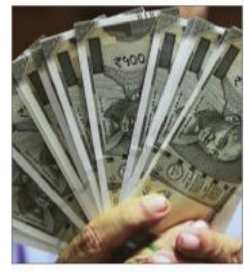
lal Oswal analyst report said.

"The sharp decline in disbursement volumes has come as a bit of a disappointment in the context of healthy trends witnessed by peers such as HDFC. Nevertheless, we believe it is a good strategy to curtail disbursements in this uncertain environment. In our opinion, this stance is likely to continue for another quarter or so," a Motilal Oswal analyst report said. Bajaj Finance's assets under management as of September 30, 2020 stood at approximately ₹137,300 crore, compared with ₹135,533 crore as